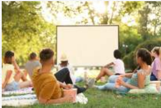
OPEN AIR THEATER