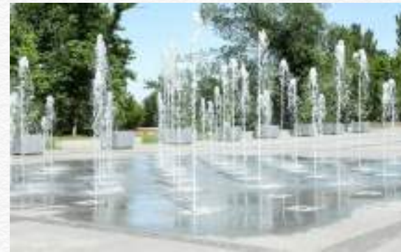
DRY DECK FOUNTAIN