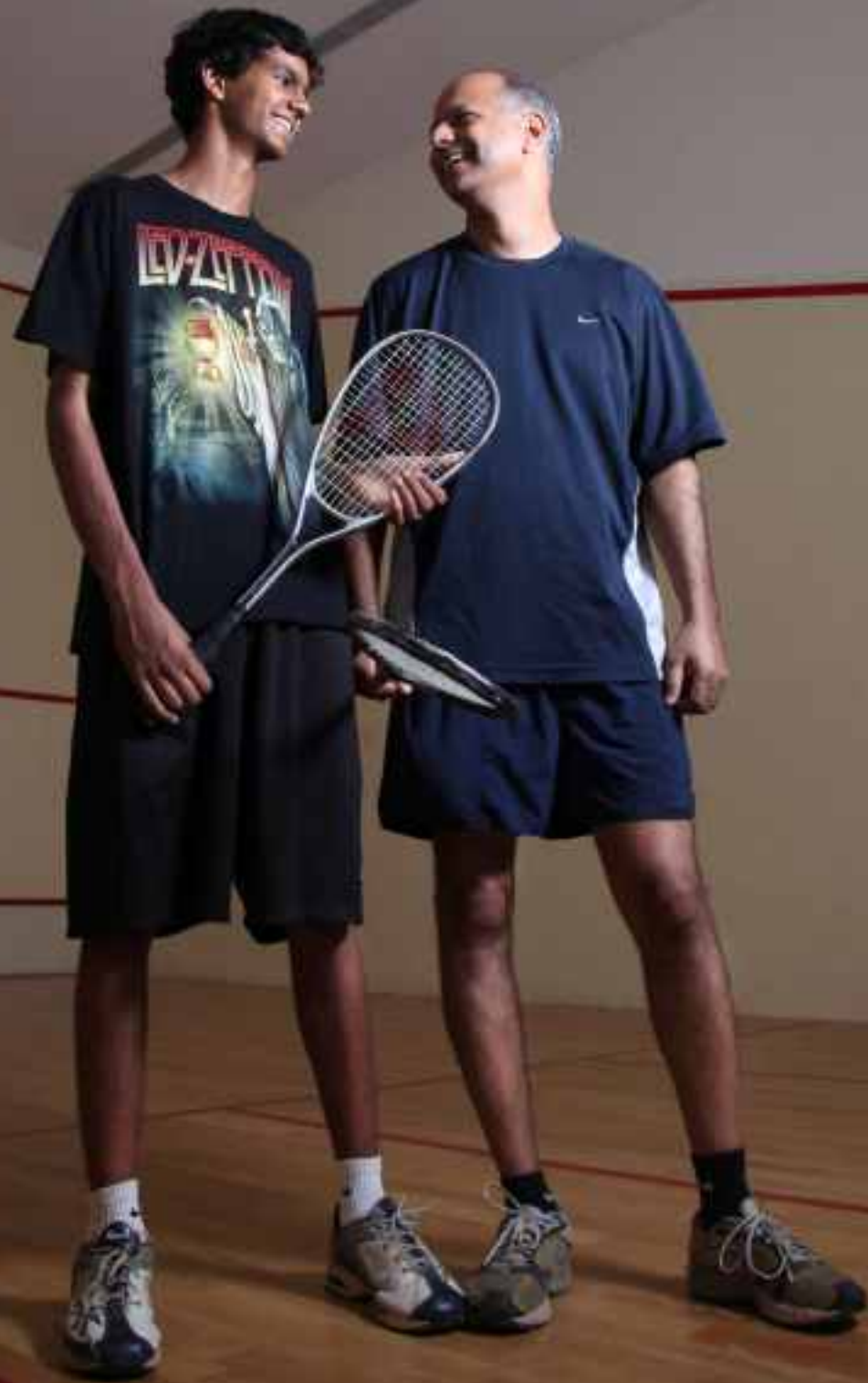
Actual picture of Squash Court at GurgaonOne

BONDS MADE OVER SQUASH, HARDENED AT STEAM & SAUNA.