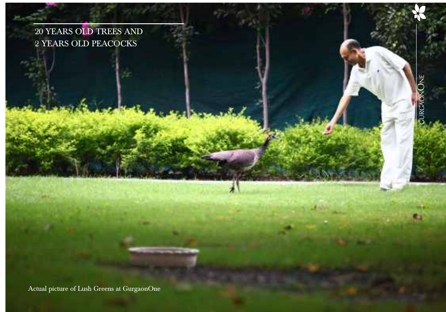
Actual picture of Lush Greens at GurgaonOne

20 YEARS OLD TREES AND 2 YEARS OLD PEACOCKS