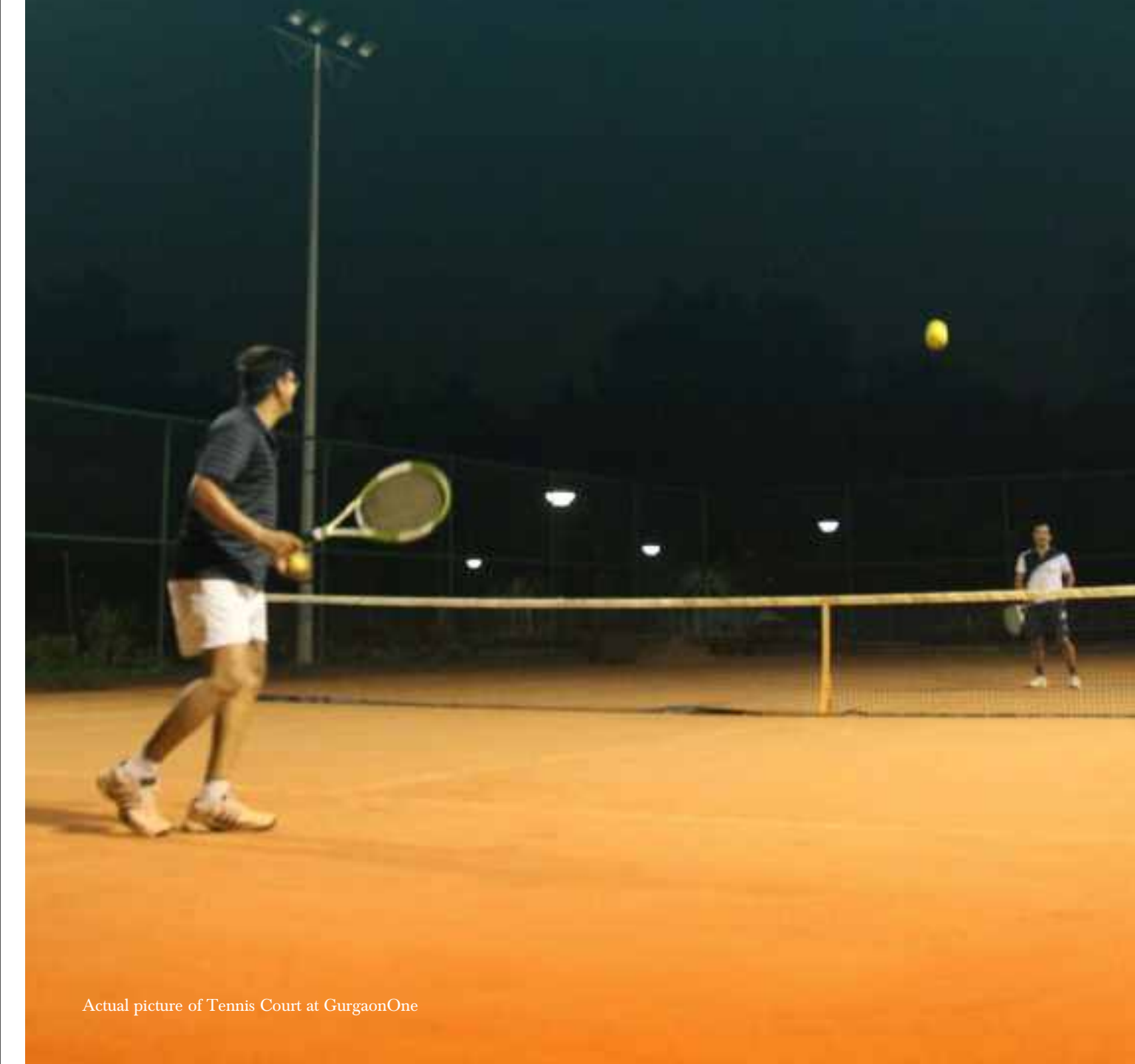
Actual picture of Tennis Court at GurgaonOne

CLUB CLASS CLAY COURTS FOR YOU TO STRETCH YOUR ARMS