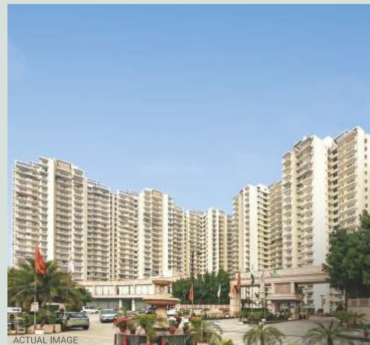
THE CORALWOOD, SECTOR-84, NEW GURUGRAM