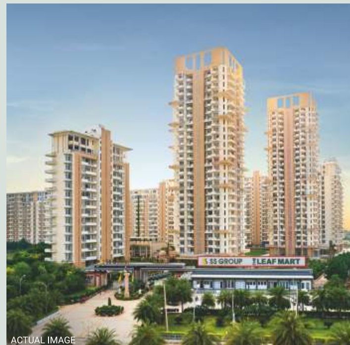
THE LEAF, SECTOR-85, NEW GURUGRAM