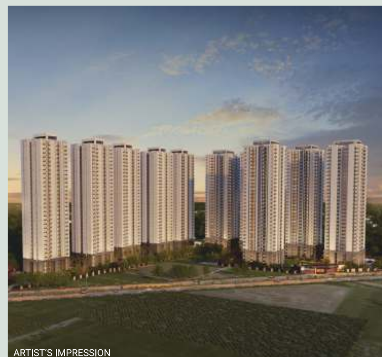
SS CENDANA, SECTOR - 83, NEW GURUGRAM