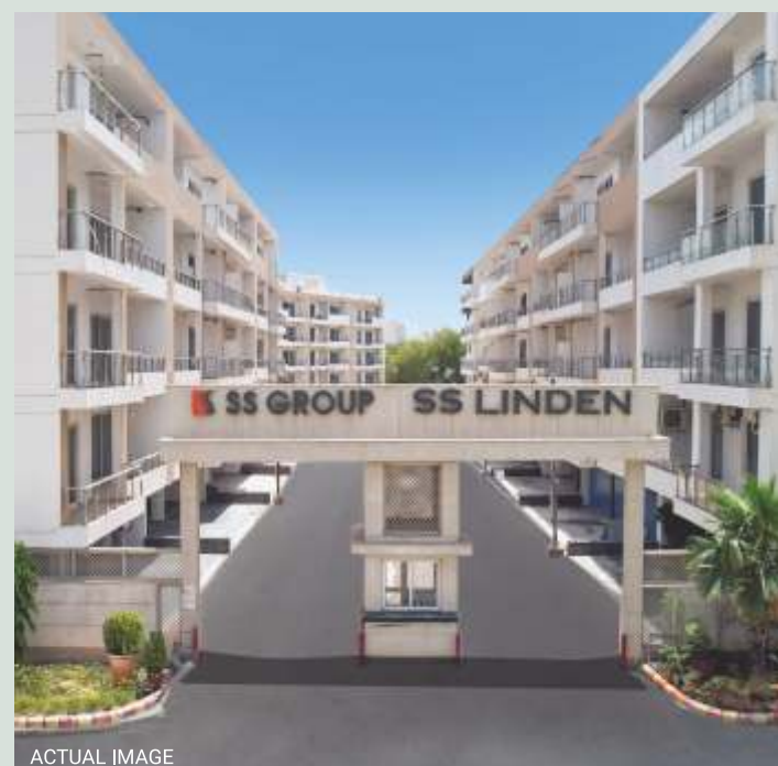
SS LINDEN, SECTOR 84 - 85, NEW GURUGRAM