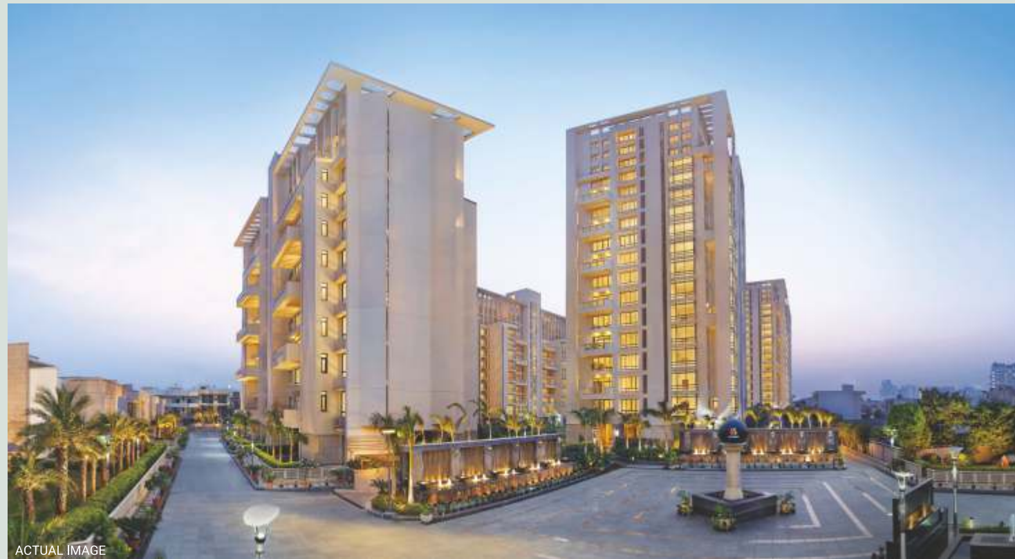
THE HIBISCUS, SECTOR-50, GURUGRAM