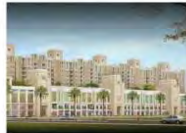
INDIABULLS river side AHMEDABAD