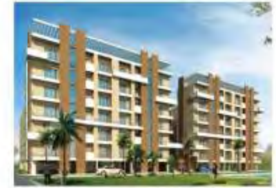
INDIABULLS central park MADURAI