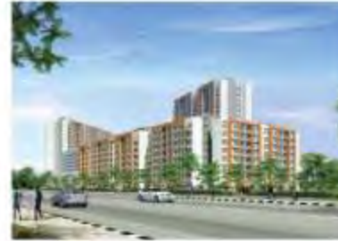
INDIABULLS central park INDORE