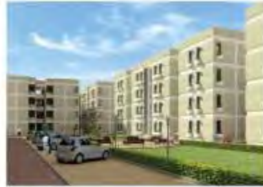
INDIABULLS central park AHMEDABAD