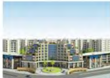
INDIABULLS MEGA MALL VADODARA