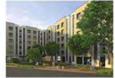
INDIABULLS vatika AHMEDABAD