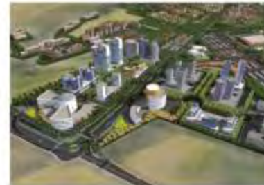
INDIABULLS Neo CITY MULTI-PRODUCT SEZ | NASHIK