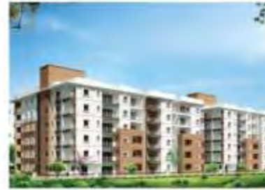
INDIABULLS central park HYDERABAD