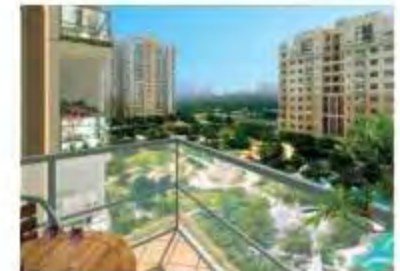
INDIABULLS CENTRUM PARK GURGAON