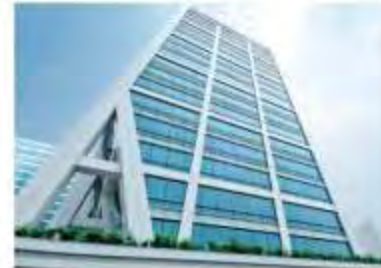
One Indiabulls Centre