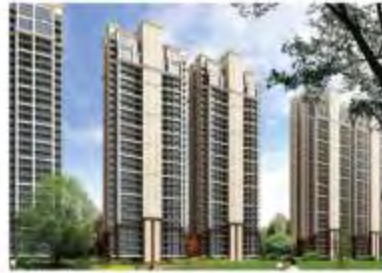
INDIABULLS greens PANVEL