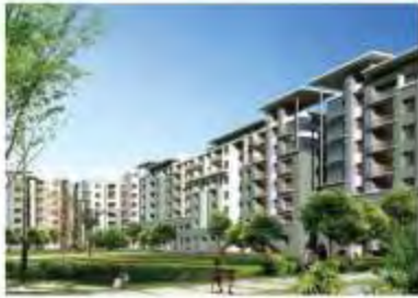
INDIABULLS greens CHENNAI