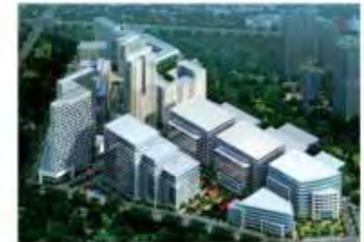
INDIABULLS TECH NOLOGY PARK IT SEZ