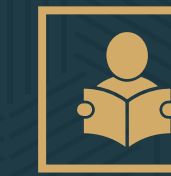
Kids Learning Park