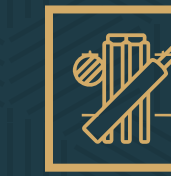
Cricket Practice Net