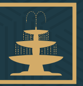
Kids Surprise Fountain